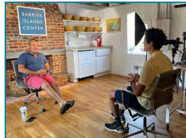
Interns working at the Barrier Islands Center.