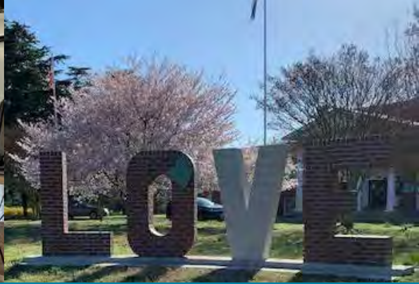
Eastern Shore of Virginia Community Foundation 2020/2021