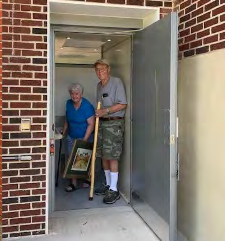
Annual Report Featuring Grants, Gifts and Financial Data from 2020