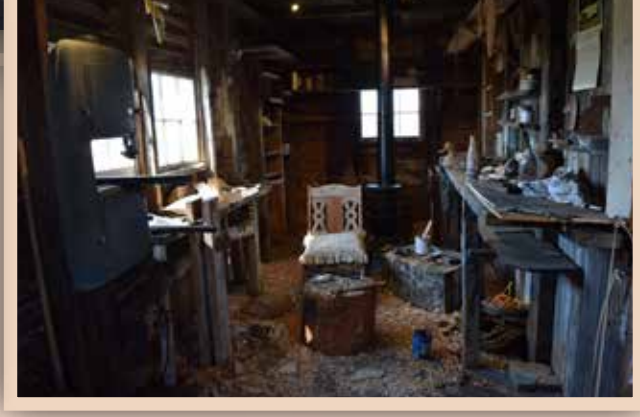
Completed Miles Hancock Carving Shed at the Museum of Chincoteague Island (top center) Completed exhibit side (bottom left), Completed carving side (bottom right)