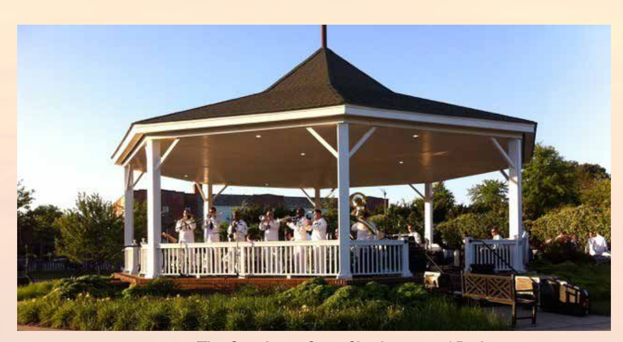
The Gazebo in Cape Charles Central Park.