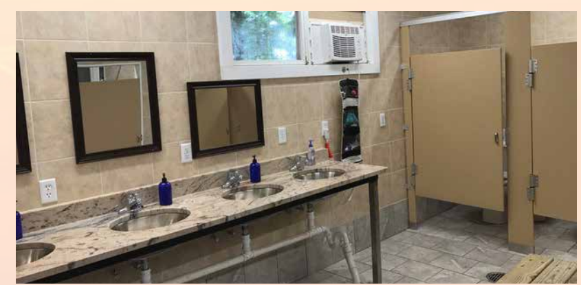
Renovated Bath House Occohannock on the Bay

Virginia Tech/Virginia Institute of Marine Science (2016) - $30,000 Chesapeake Bay Foundation (2016) - $25,000 Red Cross of Delmarva (2017) - $4,000