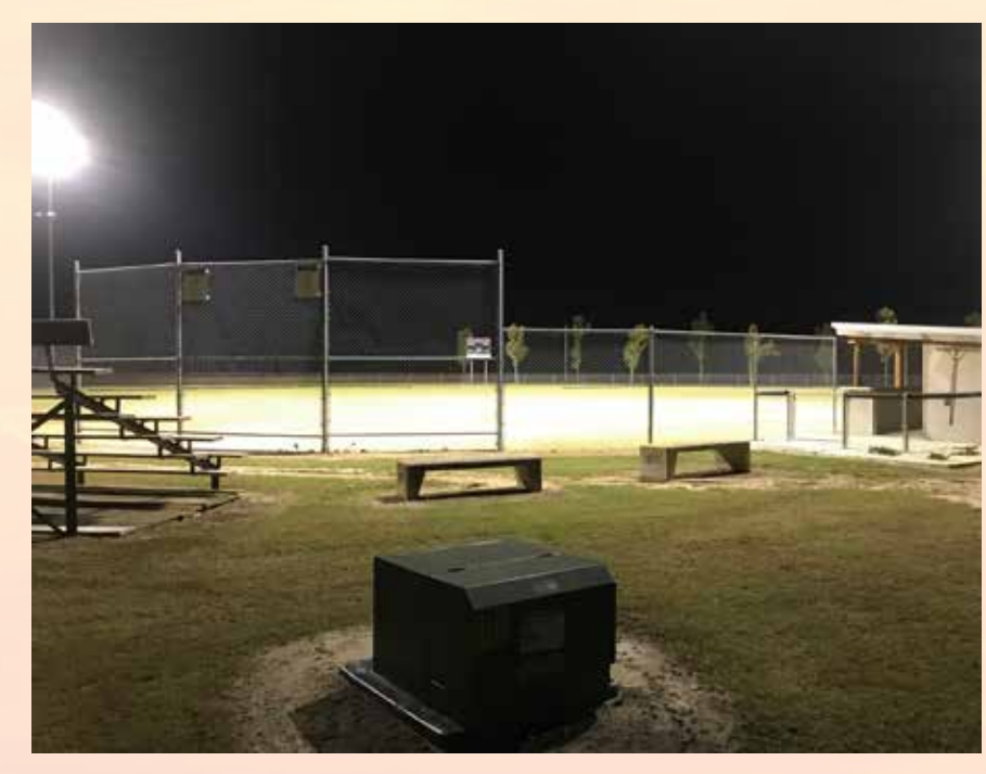
New lighting at Randy Custis Memorial Park

Detailed Financial Statements Are Available Upon Request