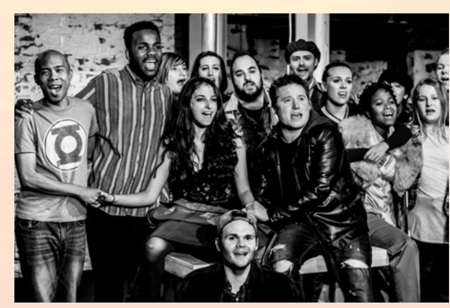
North Street Playhouse cast performing the musical "Rent"

Improve the quality of life for families & communities, particularly in the areas of basic human needs