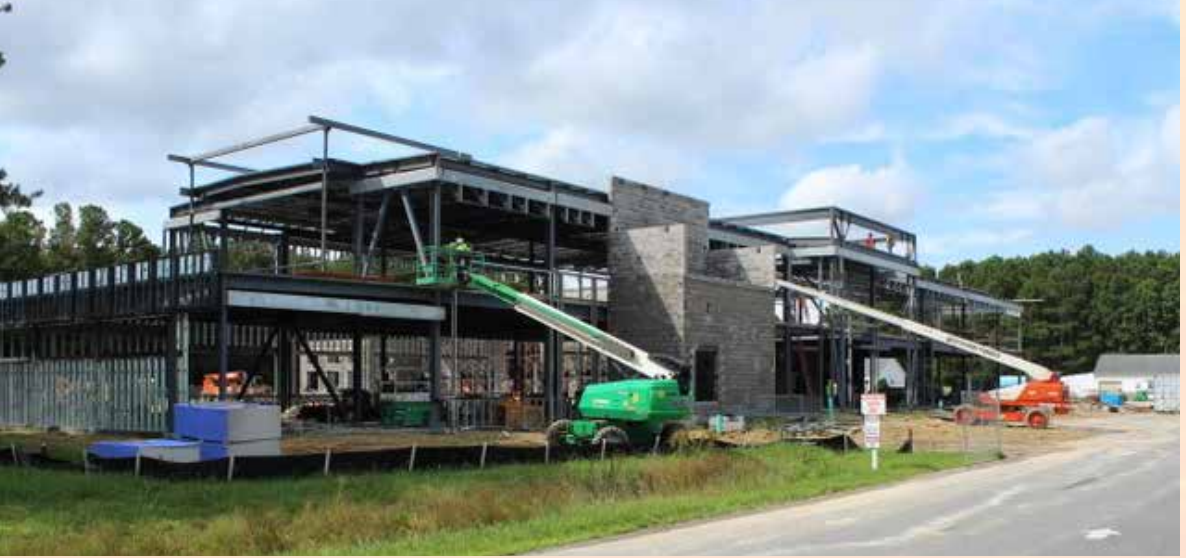
New construction on the campus of Eastern Shore Community College.

Endowments created by partner organizations are identified as "Organizational Funds" within the ESVCF assets. ESVCF maintains an ongoing program of creating Organizational Funds for local nonprofit organizations. These relationships allow for management of dedicated endowments by the Hampton Roads Community Foundation through ESVCF while generating an annual income for the nonprofit. The Eastern Shore Community College Foundation created the first Organizational Fund with ESVCF in 2006. Since then, many additional partner groups have created endowments. ESVCF looks forward to assisting additional partner groups in the years ahead through this growing program.