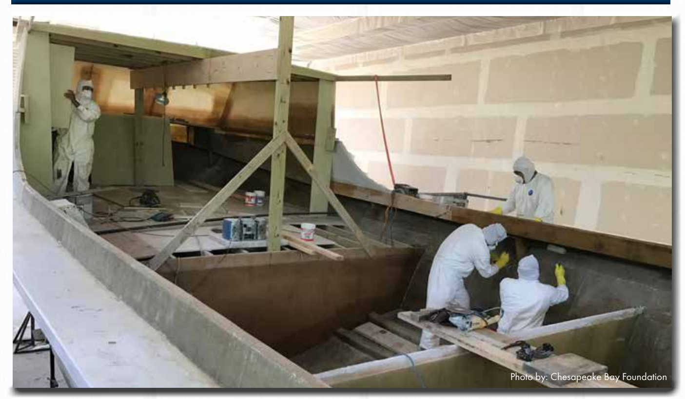
"Construction of Chesapeake Bay Foundation's educational workboat, The Mary P."

VIRGINIA TECH / VIRGINIA INSTITUTE OF MARINE SCIENCE - $30,000 - To assist with the community collaboration portion of a Poultry Litter study (10/24/2016)